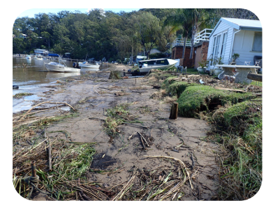
Erosion at Bradleys Beach as a result of the East Coast lows in 2015.

The good news is that we know about the kinds of health and safety risks to plan for in the future. Some examples of how councils, in collaboration with other agencies and community stakeholders, could approach these are over the page.