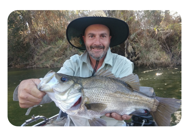
Recreational and commercial fishing and aquaculture in the catchment is very important for our communities' social wellbeing, our businesses and economy. It is worth more than $92 million a year across the area covered by the CMP.

Don't just go with the flow, be part of the conversation. Visit hawkesburynepeancmp.org