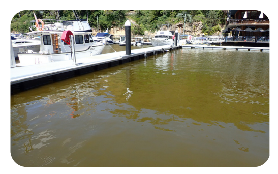
Prolonged low flows due to river regulation, combined with nutrients washed in from agricultural and industrial areas, can cause harmful algal blooms like the one in Berowra Creek, pictured above.

Don't just go with the flow, be part of the conversation. Visit hawkesburynepeancmp.org