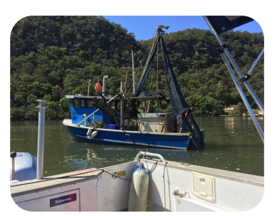
Aquaculture in the Hawkesbury includes farming of edible and pearl oysters, and harvesting of school prawns, squid, lobsters and fish.