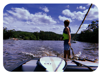
High quality water underpins all of the important values and uses of the Hawkesbury Nepean River System: from First Nations cultural uses on country, to commercial fishing and aquaculture, to farmers who utilise the river for irrigation, to tourism operators and for those pursuing social and recreational activities.